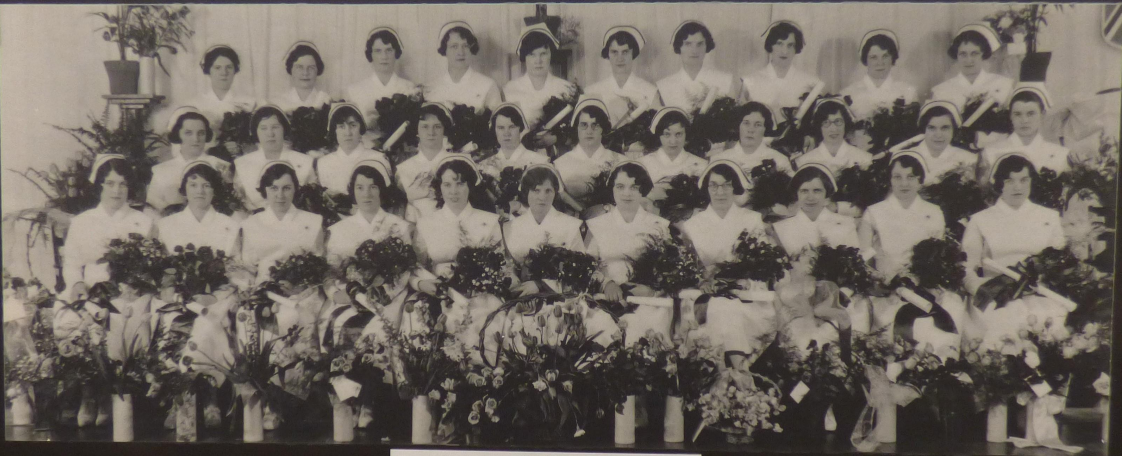
Class of 1928