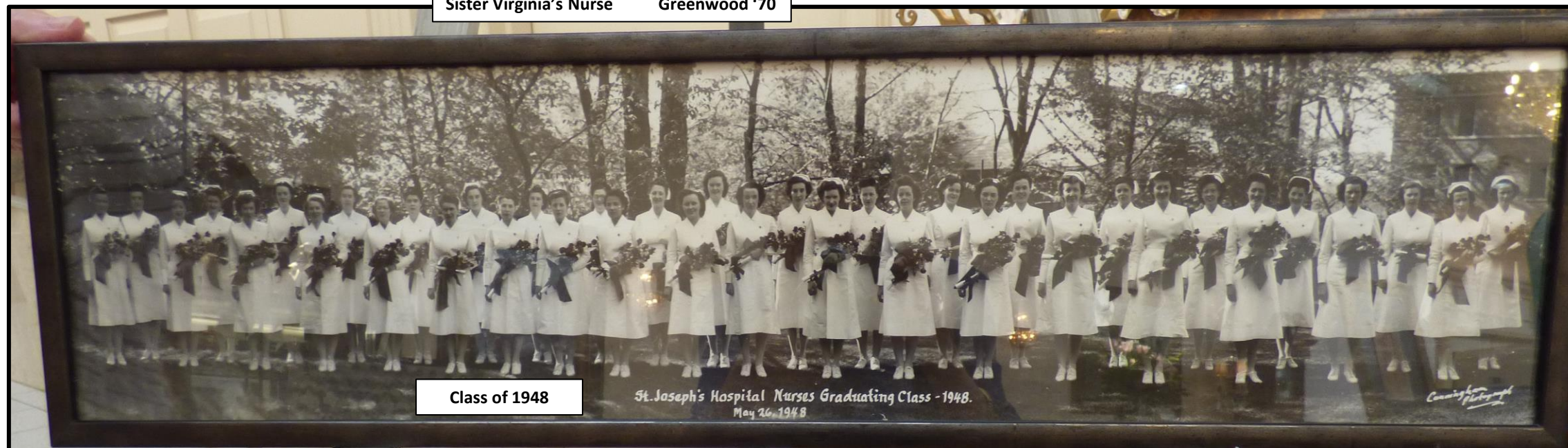
Class of 1948