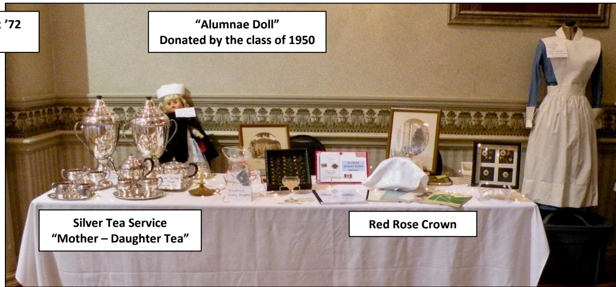
"Alumnae Doll" Donated by the class of 1950