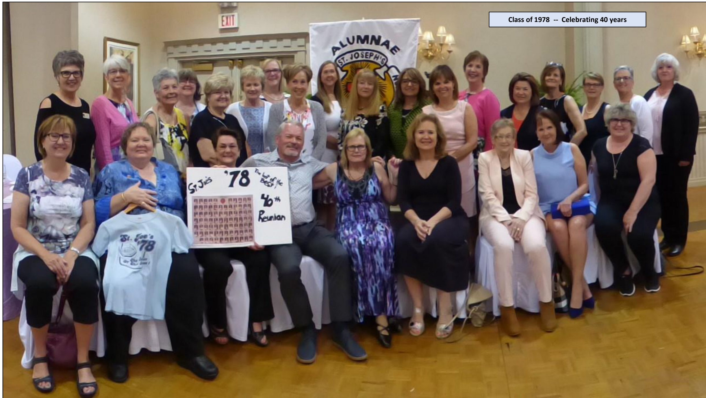
Class of 1978 -- Celebrating 40 years