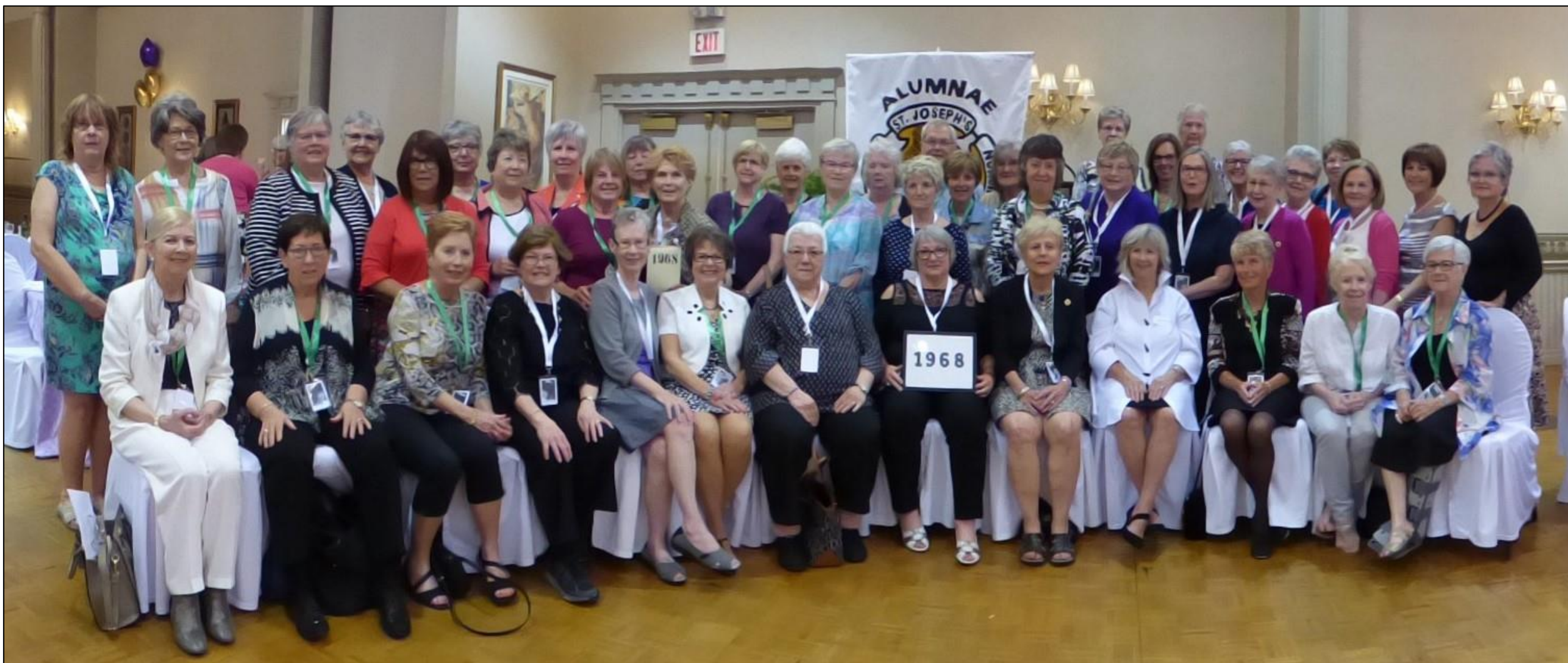
Class of 1968 --- Celebrating 50 Years