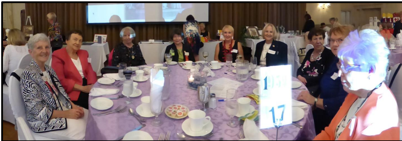
Class of 1959