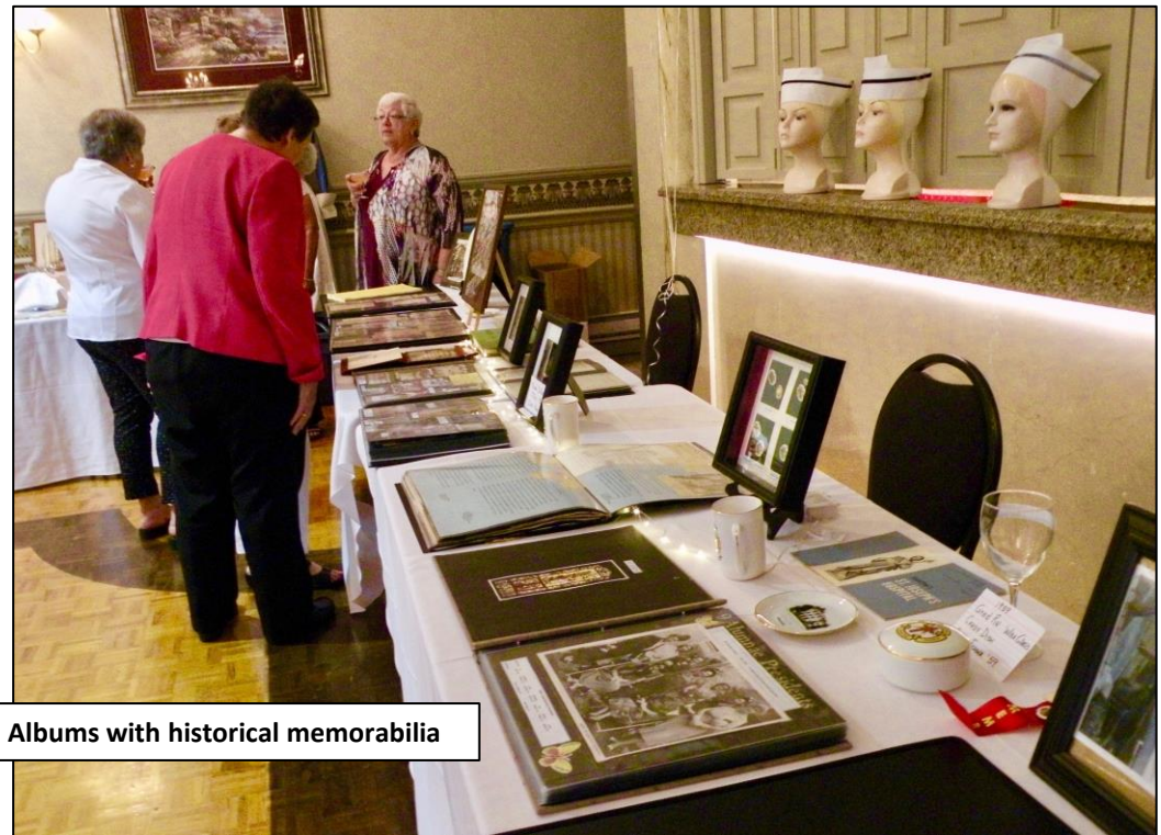
Photo Albums with historical memorabilia