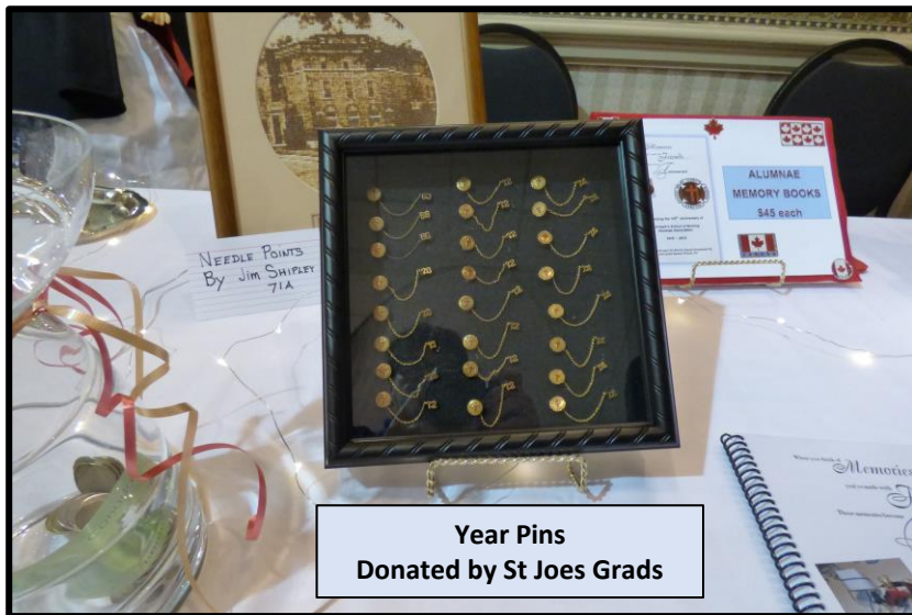
Year Pins Donated by St Joes Grads