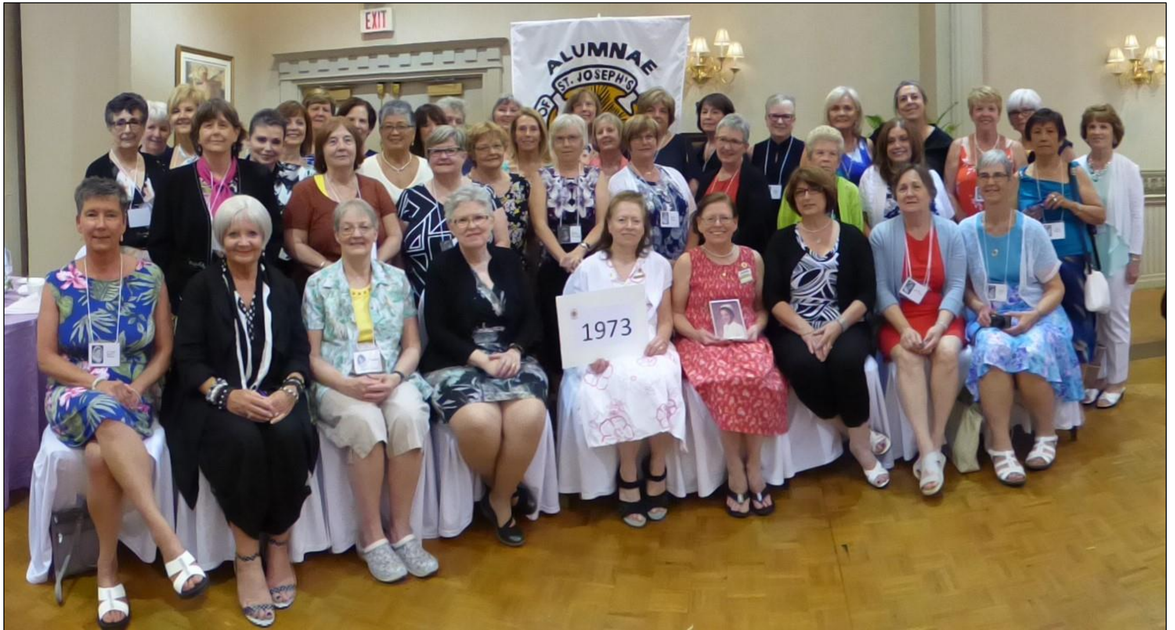
Class of 1973 --- Celebrating 45 years