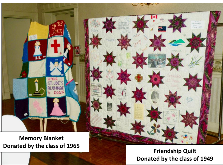
Memory Blanket Donated by the class of 1965