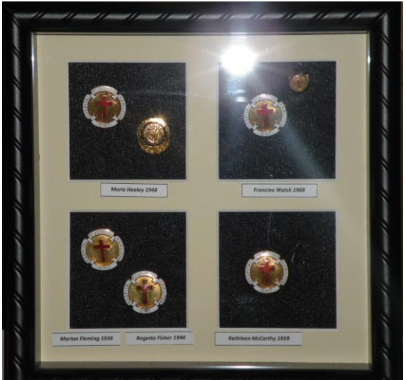
Grad Pins & Rings Donated by St Joes Grads